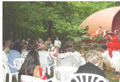
Peace Chamber, Swannanoa, NC