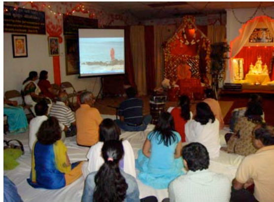
Atlanta GA Shiv Temple