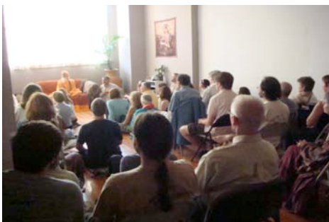
Namaste Yoga Center