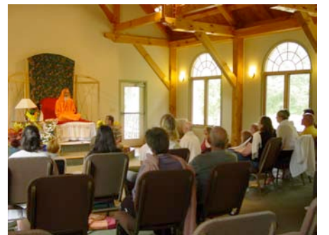
Sanctuary in the Pines, NC

“Consciousness doesn’t want to become anything, because it is everything.”