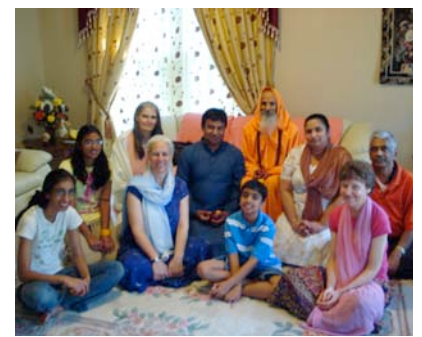
Washington DC Area