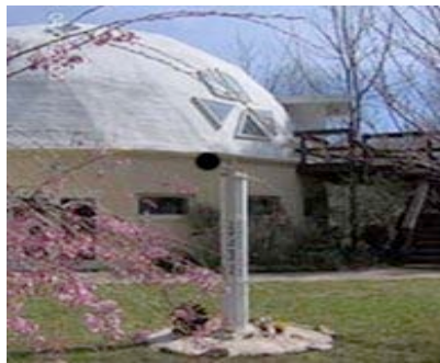
Light Center NC