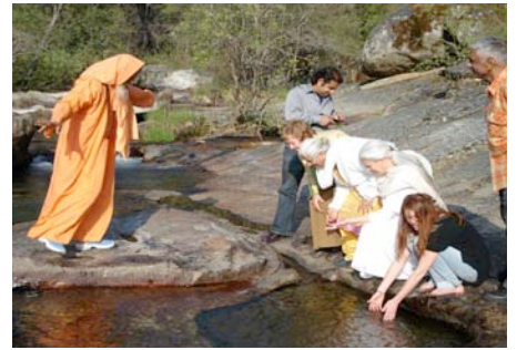
San Francisco Outskirts