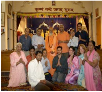
Freemont Hindu Temple

"We had a direct experience of doubtless knowledge of the Super Soul"