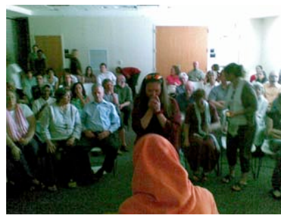
Western Carolina University