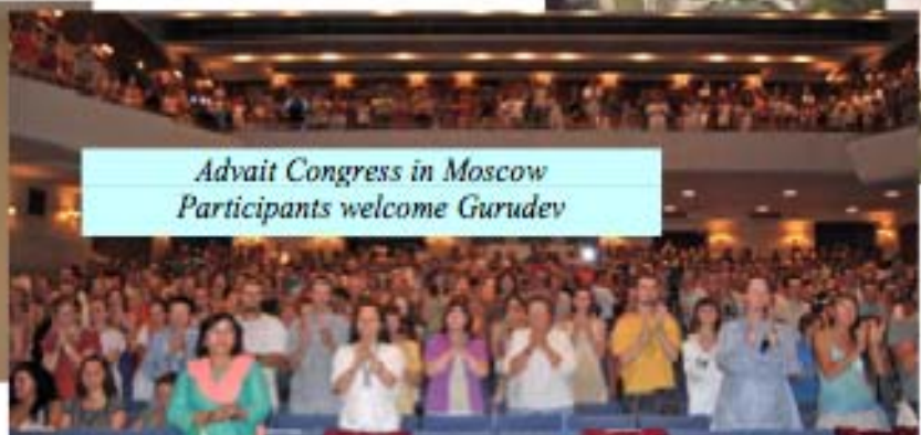
Advait Congress in Moscow Participants welcome Gurudev