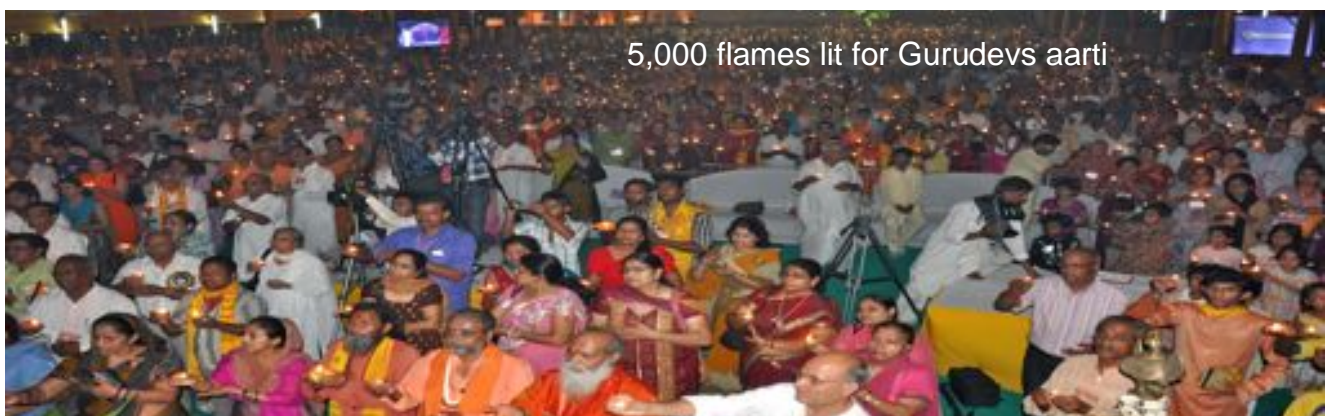
5,000 flames lit for Gurudev's arti

The culmination of the celebration was a beautiful arti ritual with 5 Thousand jyotis (divine flames) lit in gratitude to Gurudev who is a living legend of our times. The flames outshone the brilliant moon as a multitude of voices singing praises to Gurudev echoed through VatsalyaGram.