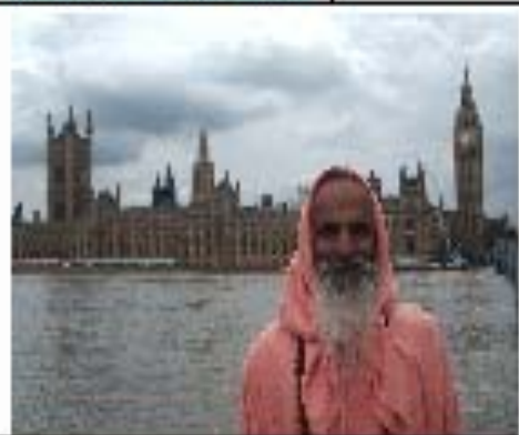
United Kingdom Satsangs in London, Derby & Birmingham