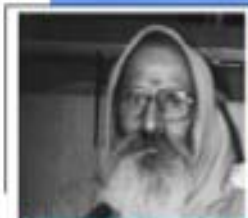
World Peace Summit of Religious & Spiritual Leaders at United Nations

Sowing seeds of illumination Gurudev teaches in North and South America, Canada, Europe, Asia, UK and New Zealand. He also is an advisor for many interfaith and peace organizations. His brilliance permeates all cultural boundaries and he remains the same whether he is in the home of a Prime Minister, in a mud hut sitting on the floor, or speaking in the United Nations.