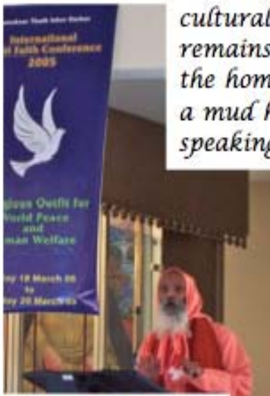
International Multi Faith Conference, Auckland, New Zealand