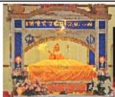
Satsangs at Sikh Gurdwara's around the world