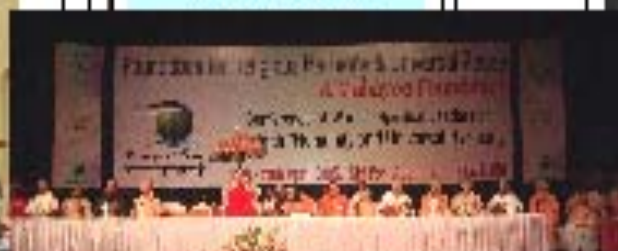
Conference of World Spiritual Leaders on Universal Harmony, Delhi