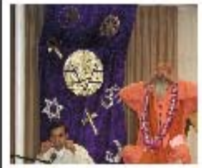
Interfaith Church, CA, USA