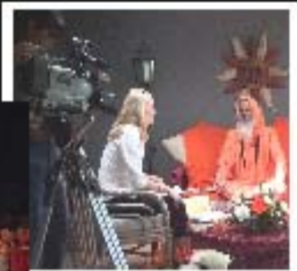
Satsangs broadcast in every country.