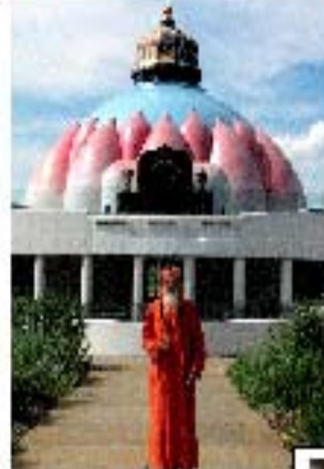
Yogaville Lotus Temple, VA, USA