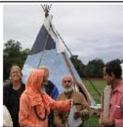
Native American Indian Council, Washington