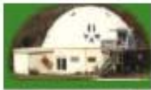
Int. Light Center ↑ Jubilee Multi Faith Church → NC, USA